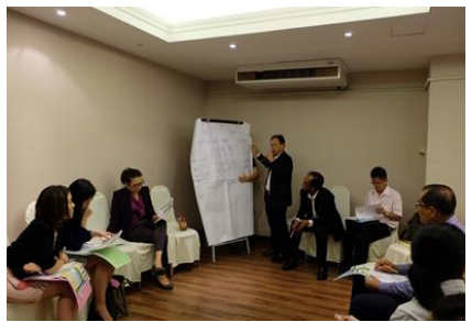
▲ The AD-Hoc Working Group Meeting on Supply Chain Control (SCC) no.1 was held on 30<sup>th</sup> August 2016. The participants divide into 2 groups, Private sector and CSOs group (left side) and Government sector group (right side). They discussed on Supply Chain Control flow chart which drafted by TEFSO

More information: http://tefso.org/en/news/