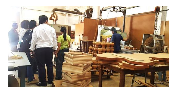
▲ CSOs FLEGT network members inspected the Chain of Custody system in the field at Deesawat Industries Company Limited.